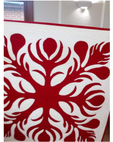
Examples of Hawaiian Quilting