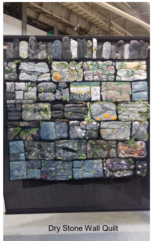
Dry Stone Wall Quilt